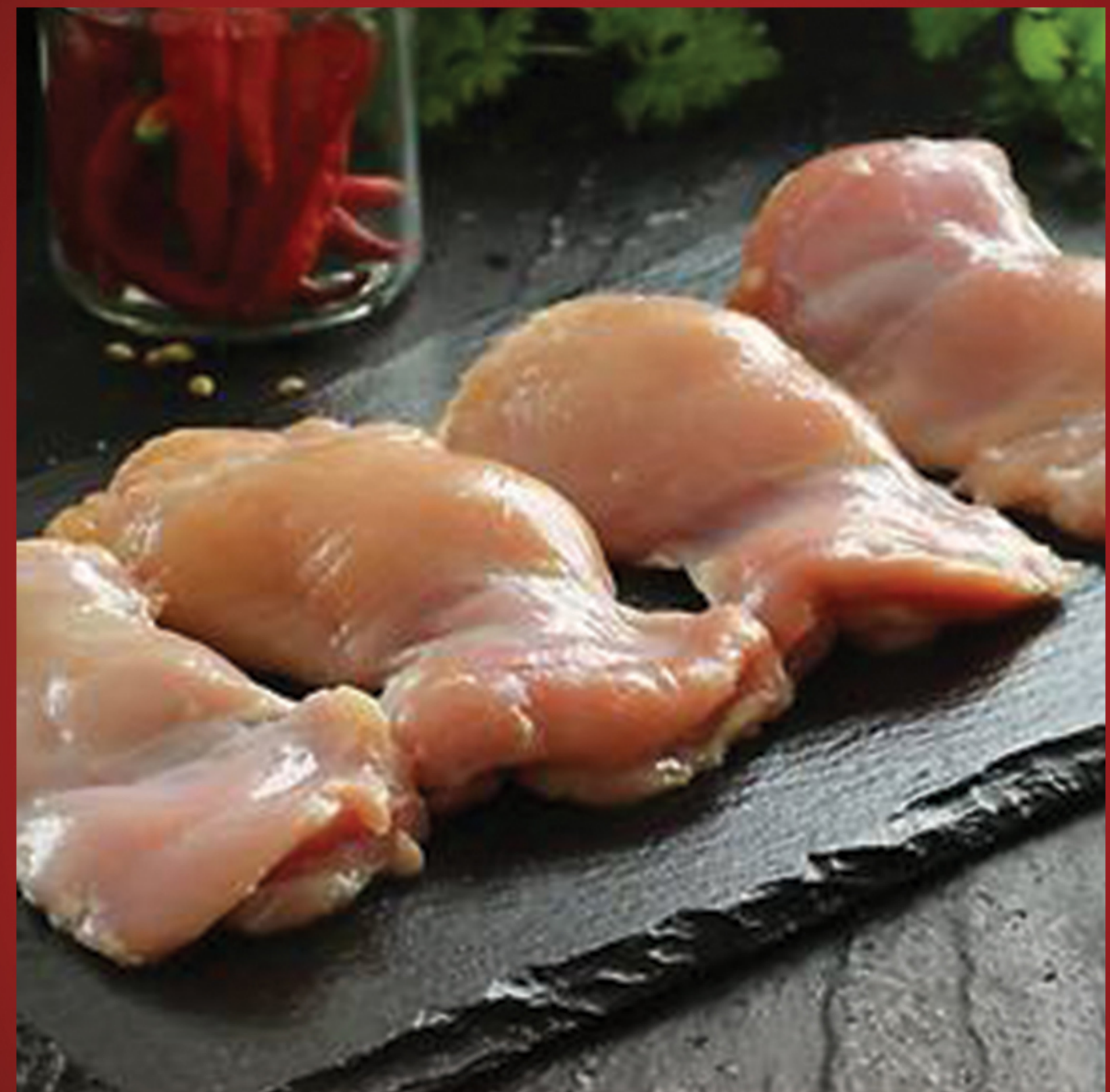
Chicken Leg Boneless