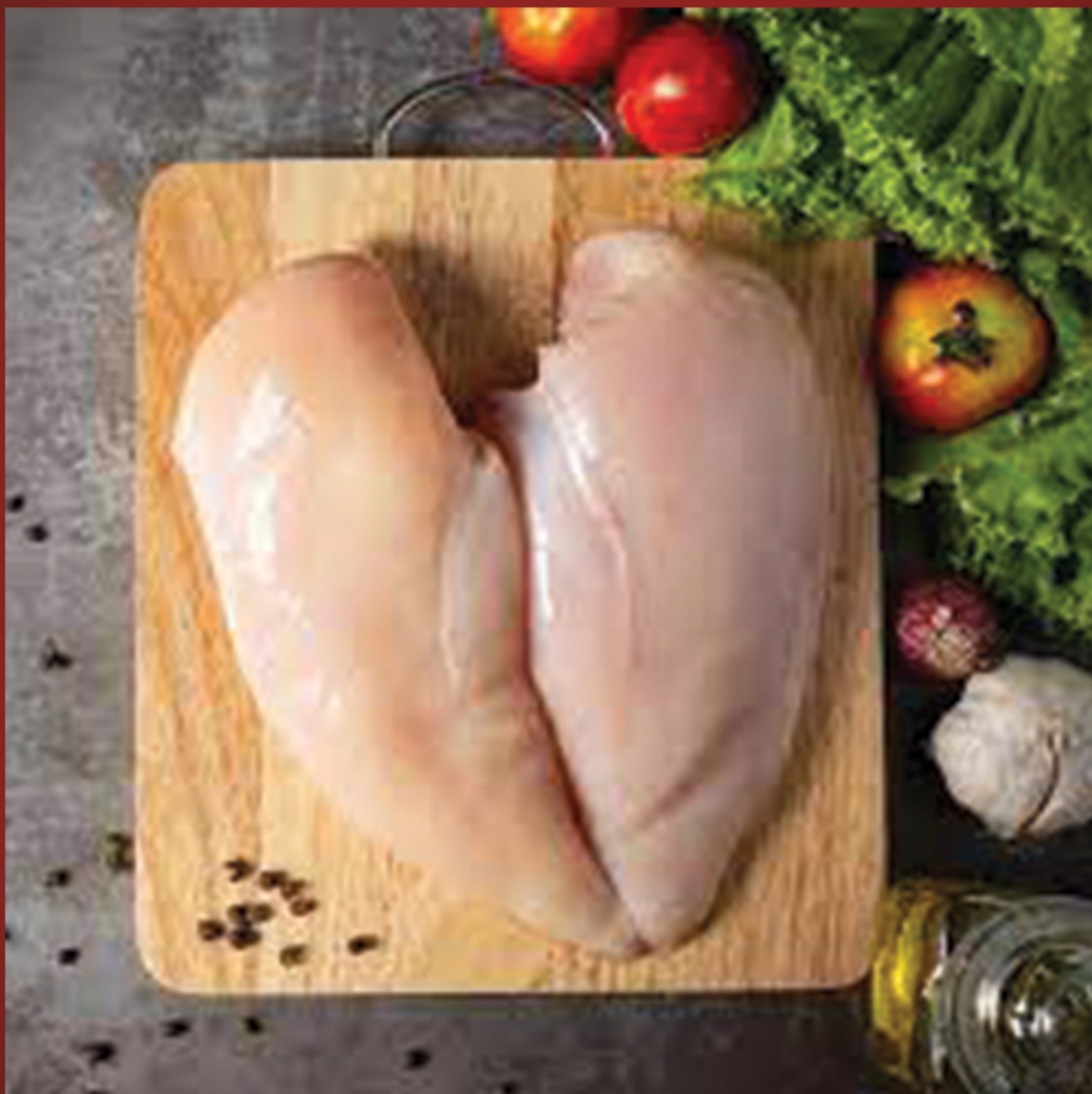
Chicken Breast Boneless