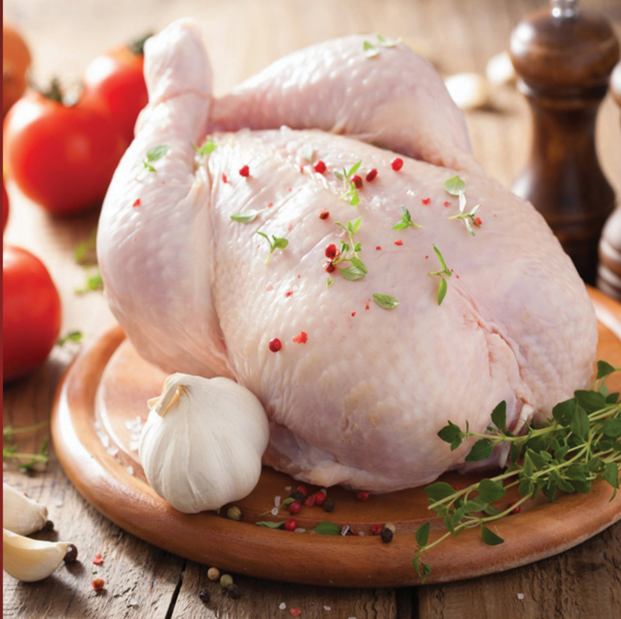
Whole Chicken With Skin