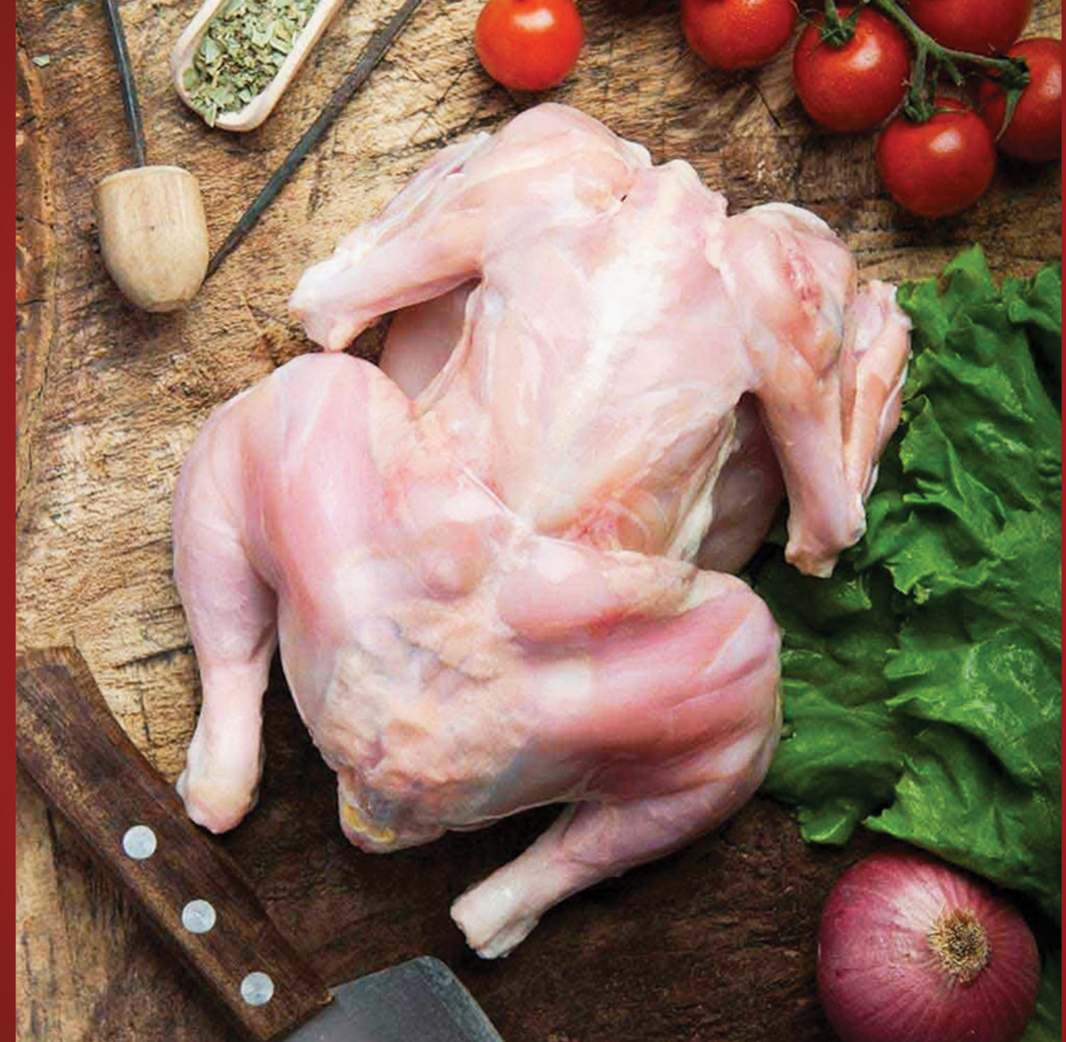
Whole Chicken Without Skin